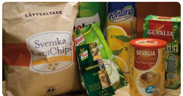
Examples of packagings where Xylophane could be used

Interest is great and expectations high for how Xylophane can develop and renew the packaging industry's traditional materials. Xylophane has together with the sack producer Jonsac previously proven the function of the material as a grease barrier in industrial bags for spices. Work is ongoing to adapt and verify the material also for other applications, also this in close co-operation with customers.