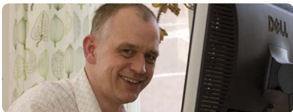
Capee Group's developers are one step ahead.

The function is simple to use and extremely fast. When operators notice a deviation in production and register that in their trend curve, an answer is received, which details what factors can have caused it. The result is presented as arrows in the controlsystem's imaging, and the possible causes are ranked in order of probability.