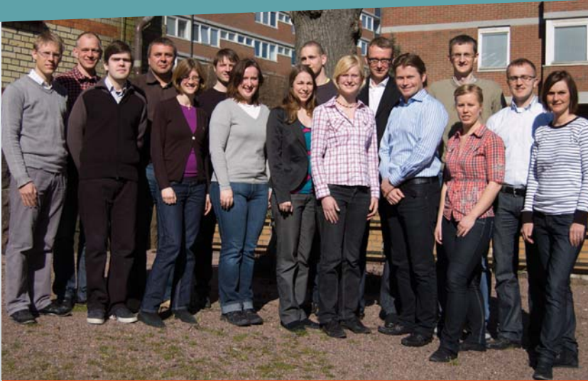
Pulp and Paper Power are pleased about the network's successes

NEWS NEWS NEWS NEWS NEWS NEWS NEWS NEWS NEWS NEWS NEWS NEWS NEWS NEWS